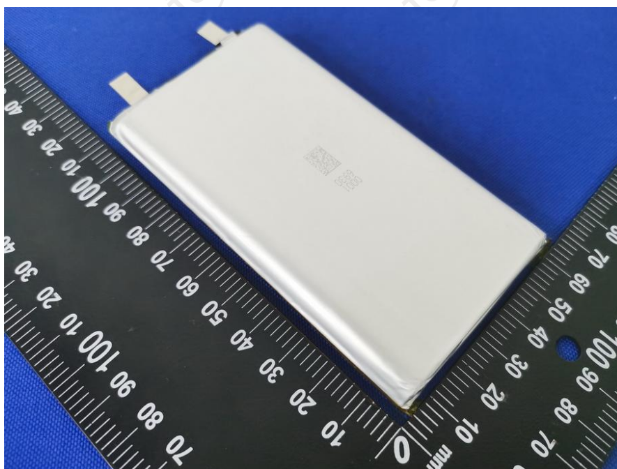
Picture 2. Cell view